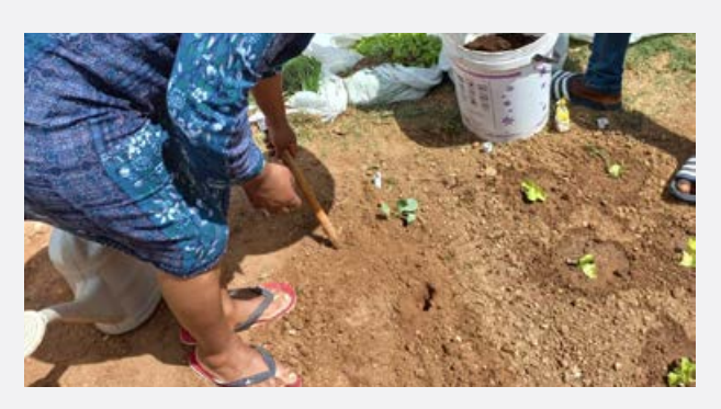
Land preparation and doing through practice