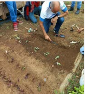
Land preparation and practice through doing