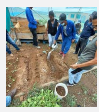
Land preparation and practice through doing