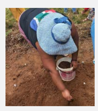
Doing through practice