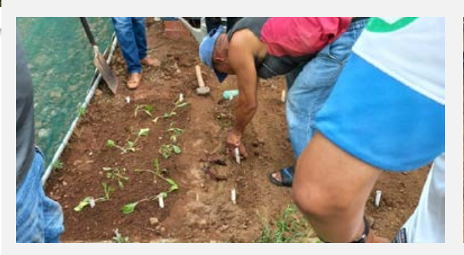
Land preparation and practice through doing