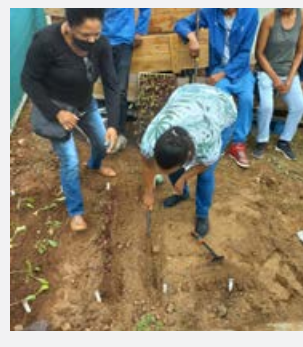
Land preparation and practice through doing