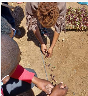
Learning through doing