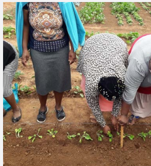
Training through doing