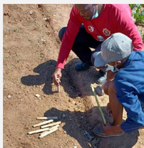
Training through doing