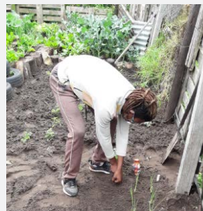
Learning through doing