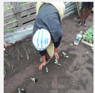
Learning through doing