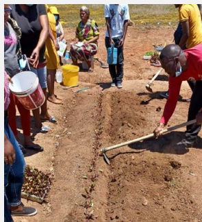
Learning through doing