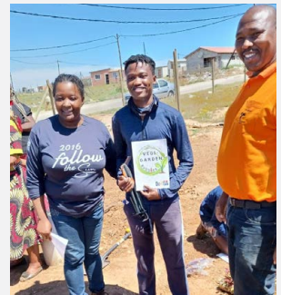
Handing over of manuals, tools and seedlings