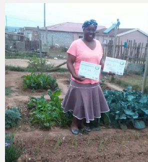
Community member receiving certificate of completion