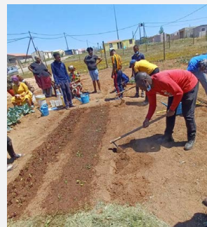
Learning through doing