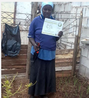
Community member receiving certificate of completion