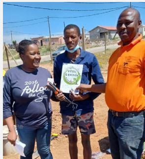
Handing over of manuals, tools and seedlings