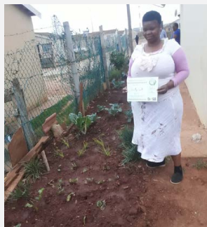
Community member receiving certificate of completion