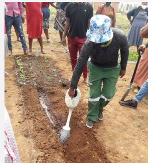
Training through doing