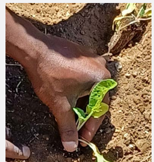
Learning through doing