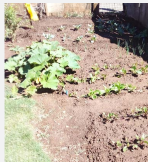
Seedlings received that were planted the next day