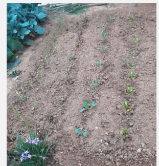
Some of the trainees gardens after training