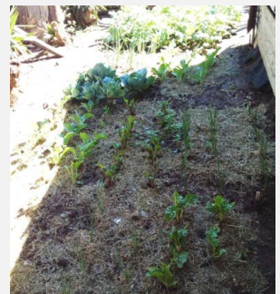
Seedlings received that were planted the next day