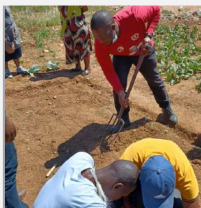
Training through doing