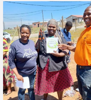
Handing over of manuals, tools and seedlings