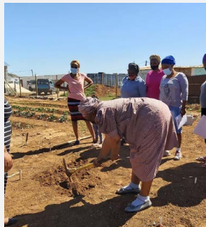
Learning through doing