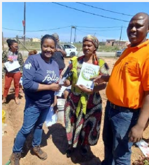
Handing over of manuals, tools and seedlings